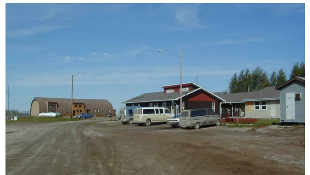
Sakimay's Governance Center on left and Health Center on right