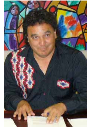
IGR President / CEO initialing the Licensing Agreement-in-Principle

The FSIN Chiefs-in-Assembly and First Nations leadership will be voting on the agreement at a future FSIN assembly. It is our hope that they give us their approval to start licensing your Bingos, Breakopens, Raffles, Poker Tournaments and Monte Carlo Events.