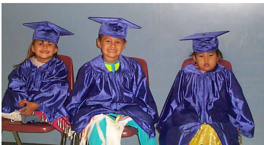
Students from Sakimay's Goose Lake School Graduation 2006

First Nations may appoint IGR to carry out the administrative task of Licensing and Regulating charitable gaming on their lands. This is done by signing a Band Council Resolution (BCR) delegating this task to IGR. Of the 75 First Nations in Saskatchewan IGR has received 67 BCRs.