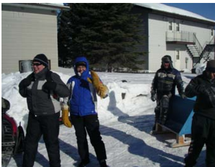
Some of the "Peacekeeper" youth sporting IGR toques during their winter exercise in Northern Saskatchewan.

The Indigenous Gaming Regulators (IGR) is an Institution of the Federation of Saskatchewan Indian Nations. IGR is a non-profit corporation with the mandate to license and regulate on-reserve charitable gaming.