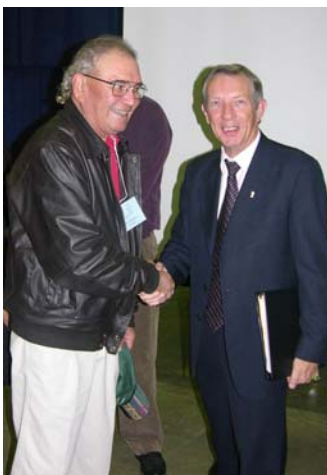
Senator PeeAce and Premier Calvert

With First Nations, For First Nations, By First Nations