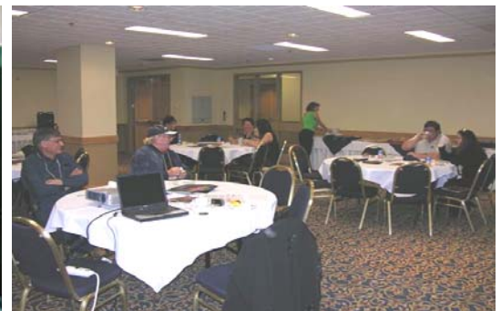
IGR sponsored a Elders Meeting and Resting Room at the 2005 FSIN Winter Assembly.