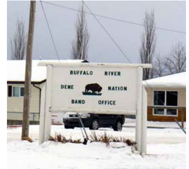
Buffalo River Band Office

The IGR negotiation team has nearly finalized a Licensing Agreement. This agreement will allow us to begin licensing and regulating on-reserve gaming. The terms and conditions agreed to take into account the needs of the First Nations.