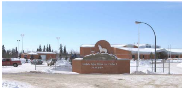
Big River's Elementary School

Big River is also well known for the Whitefish Jrs., the world