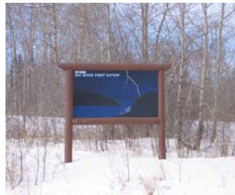
"Welcome to Big River First Nation"

If you are (or plan to be) involved in charitable gaming and would like us to visit you, please contact IGR toll-free at 1-877-477-4114.